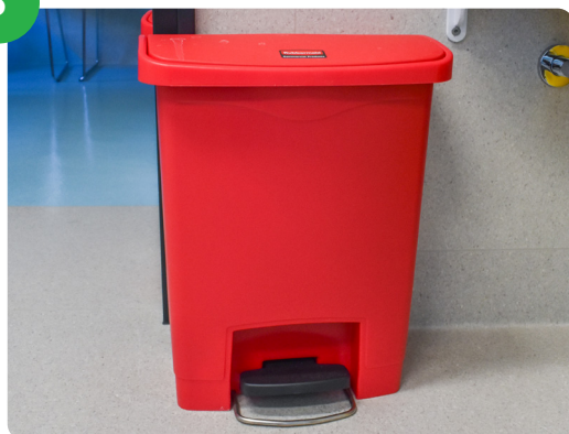
Dispose of strips and repack meter