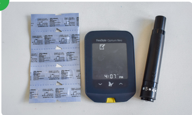
Prepare to check blood glucose