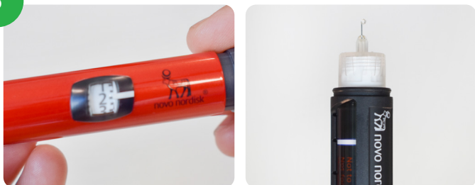
Dial to 2 and discard the insulin