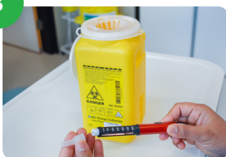
Place cap on needle and unscrew. Put sharps in bin.