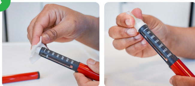
Clean the tip